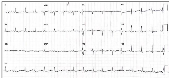
Figure 3: Repeat ECG, showing clear sinus p waves

After a careful review of the ECG by a cardiology resident, she was found to have sinus rhythm with artifacts, due to sharply contoured p waves and more prominent artifacts in the limb leads compared to the chest leads. A repeat 12 lead ECG (shown in Figure 3) was done after immobilizing her limbs, which showed sinus rhythm with very few artifacts.