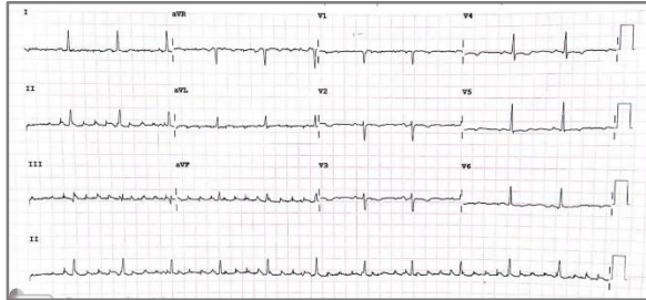
Figure 2: Initial ECG shows prominent “pseudo flutter” waves in inferior leads

hospitalization, she started having right-sided pleuritic chest pain. Cardiac monitor and rhythm strip suggested rhythm abnormality (Figure 1). Initial 12 lead ECG was interpreted as atrial flutter by the primary physician. (Figure 2).